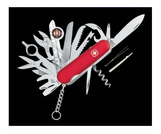
Figure 5: Jack of all trades, master of none