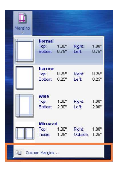
Figure 8: Dropdown gallery for margins