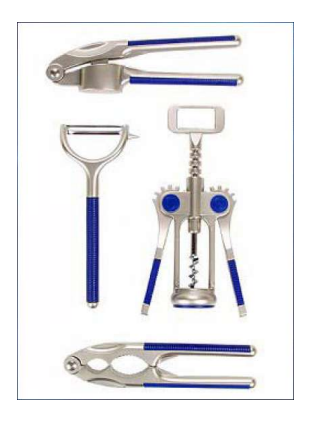
Figure 6: Get the best possible tool for each task