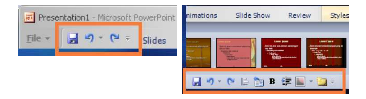
Figure 10: The two modes of the quick access toolbar: Compact (left) and Full Size (right)